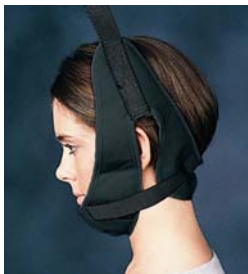
DELUXE HEAD HALTER