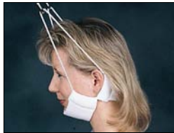
DISKARD HEAD HALTER