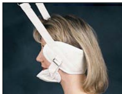
REPRO STYLE HEAD HALTER